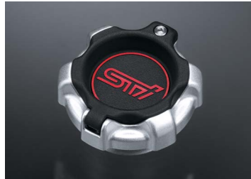
STI OIL CAP