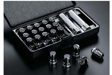
STI SECURITY WHEEL NUT SET