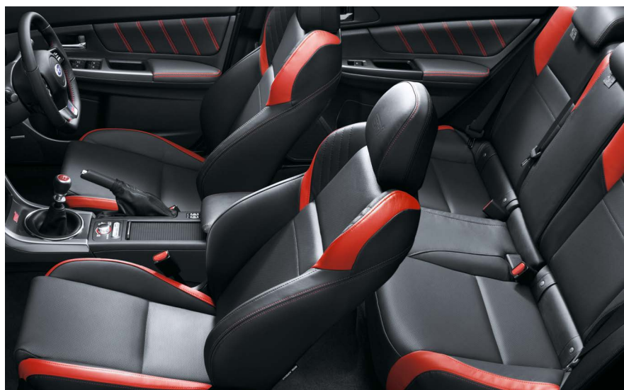
BLACK LEATHER 1 : WRX STI Premium