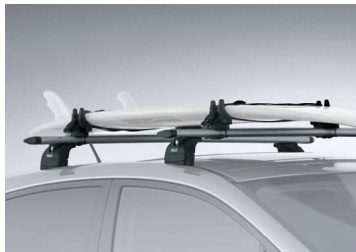
SURFBOARD CARRIER 2