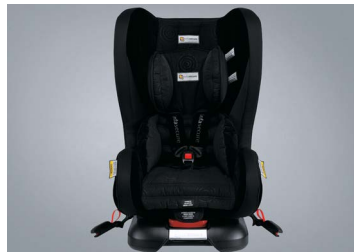
BABY SEAT - KOMPRESSOR II LUXURY CAPRICE (ISOFIX COMPATIBLE)