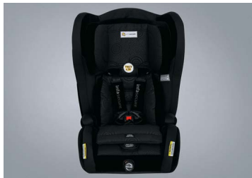
BABY SEAT - EVOLVE EBONY