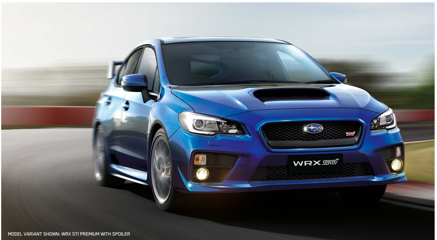
MODEL VARIANT SHOWN: WRX STI PREMIUM WITH SPOILER