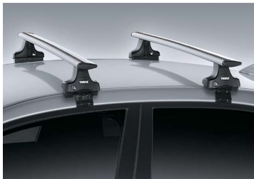
ROOF CROSS BARS