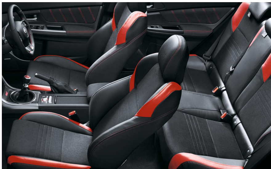
BLACK ALCANTARA® WITH LEATHER 1 ACCENTS: WRX STI