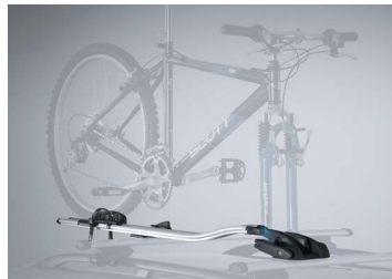
BICYCLE HOLDER 2 (FORK MOUNTED)