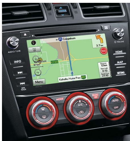
INTEGRATED INFOTAINMENT SYSTEM WITH SATELLITE NAVIGATION: WRX STI and WRX STI Premium