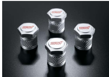
STI VALVE CAP SET