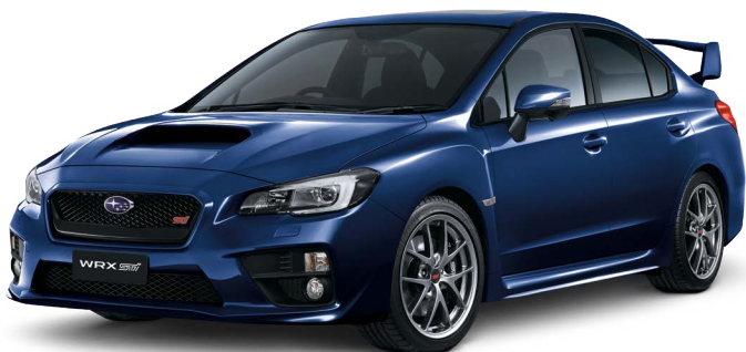
LAPIS BLUE PEARL