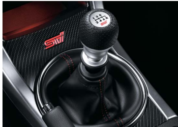
STI LEATHER SHIFT KNOB (6MT)