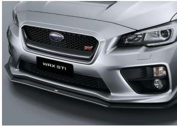
STI FRONT UNDER SPOILER