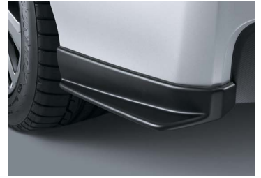
STI REAR SIDE UNDER SPOILER