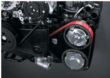
STI COMPETITION TIMING BELT