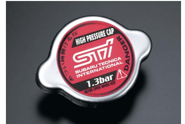
STI HIGH PRESSURE RADIATOR CAP