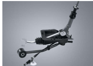
STI SHORT THROW SHIFTER