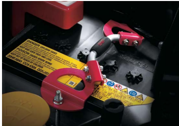
STI BATTERY CLAMP HOLDER