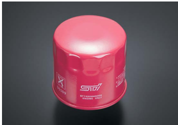
STI COMPETITION OIL FILTER