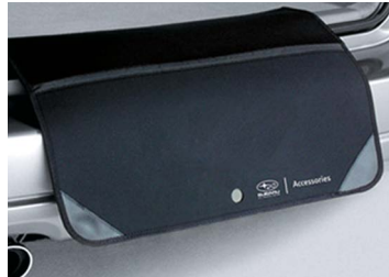
BOOT LIP AND BUMPER PROTECTOR