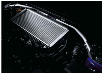
STI FLEXIBLE TOWER BAR