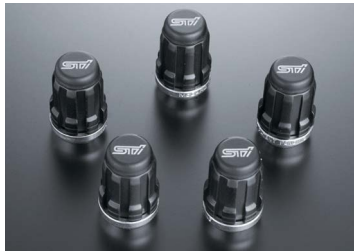
STI WHEEL LOCK NUT SET OF 20 (BLACK)