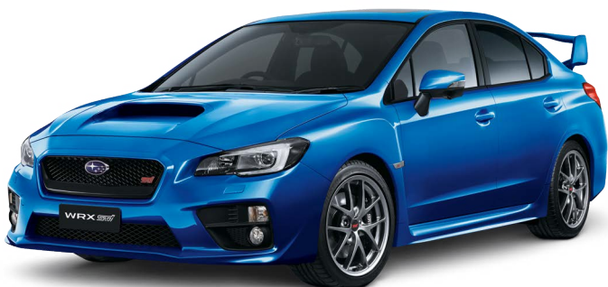
WR BLUE PEARL

All colours available in all model variants.