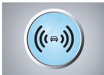
SECURITY ALARM SYSTEM