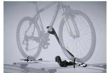
BICYCLE HOLDER 2 (UPRIGHT)