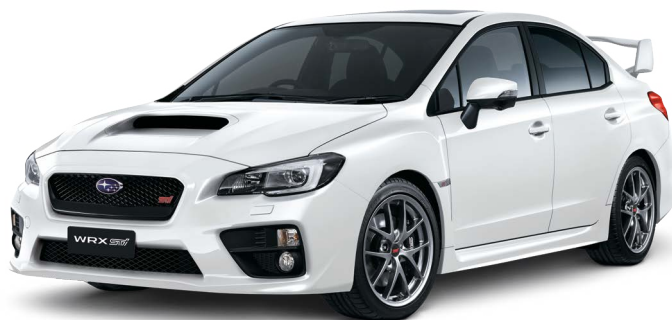
CRYSTAL WHITE PEARL